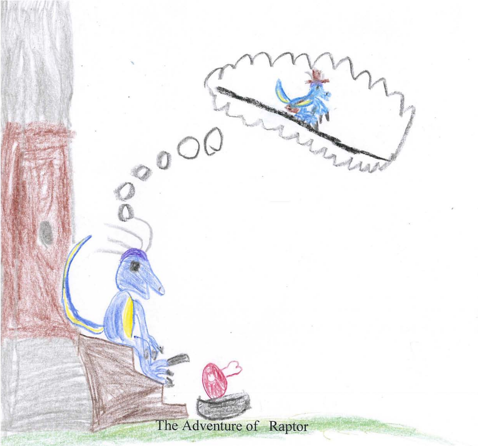
The Adventure of Raptor